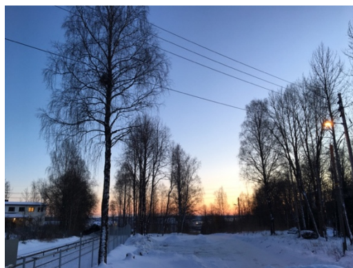
Sunset at my hall

There are many orientation activities held by BI in the first month, like joining city tour, learning some basic Norwegian, going ice skating for free and having night party. I joined most of them with my friends. I knew more about Oslo little by little through these events.