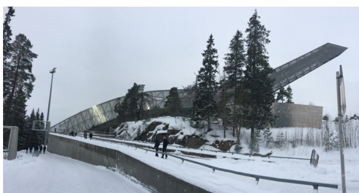
Visit Holmenkollen during city tour

I started to join Blinner (a free dinner at BI every month and I recommended to join it so much) to enjoy some Norwegian food and meet friends. During winter, it is a good time to play some winter sport and games like playing sleigh. I also went to visit different tourist spots in Oslo during January.