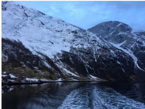
Photos on cruise

In this month, I also went to Tromsø for the northern light and it was the most unforgettable trip to me. It was cloudy and the Aurora forecast was very low (just two out of nine in scale) on the day of joining Aurora trip so I did not have high expectation to see Aurora. However, after about an hour at the destination, the Aurora started to appear! It grew stronger and stronger. I even saw different kinds of Aurora shape such as tornado, spiral and string shape. It is really amazing that I could even see the Aurora moving! I totally appreciate the power of natural beauty. I would never forget the moment when I see the northern light.