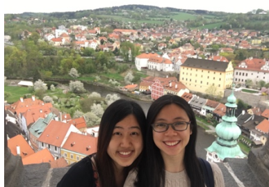
Photos at Prague