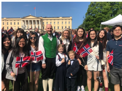
Photos with a Norwegian family

On 17 May, it is Norway National Day. At this day, most of the Norwegian would wear Bunad, Norwegian traditional clothing, with National flag in hands to celebrate National Day in front of Royal Palace. Seeing their enthusiasm for country, I also felt excited and therefore went celebrating National Day with friends on that day. For the other days, I mainly studied for exam and after completing all my exams, I finally came back Hong Kong on 31 May.