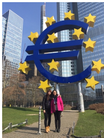
Euro tower at Frankfurt