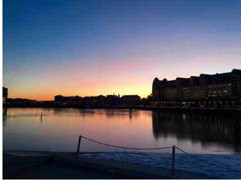
Sunset at National Opera House

I visited different places in Oslo cities during free time and discovered the beauty in Oslo. The sunset there is really nice and I tried various places for sunset. National Opera House and Akershus Fortress are recommended good places for viewing. I love the sky's gradually changing colour of blue, pink, orange and yellow during sunset, which is so wonderful.