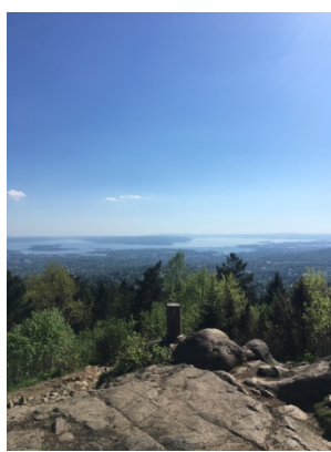
At top of hill