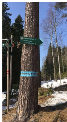
Blue mark on trunk

On 17 May, it is Norway National Day. At this day, most of the Norwegian would wear Bunad, Norwegian traditional clothing, with National flag in hands to celebrate National Day in front of Royal Palace. Seeing their enthusiasm for country, I also felt excited and therefore went celebrating National Day with friends on that day. For the other days, I mainly studied for exam and after completing all my exams, I finally came back Hong Kong on 31 May.