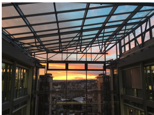
Sunset at BI

I arrived Oslo with other UST exchange students on 5 Jan. It was freezing cold and I still remember I could barely walk on the icy road with my heavy luggage. January is a winter season in Oslo and the daytime is short that the sunset there is so early. The sky started looking dark at around 4p.m. BI is a school with many big transparent windows. I could always enjoy beautiful view at school.