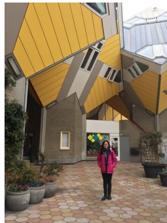
Cubic House at Rotterdam