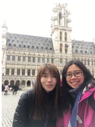
Grand Place at Brussel

There is a long Easter holiday in March (Norway has the world's longest Easter holiday!). So I could go for a long trip during Easter. I went to Brussel, Paris, Frankfurt, Rotterdam and Amsterdam. Brussel is a place which is full of chocolate. If you are a chocolate lover, you definitely have to go there and try the chocolate in every shop! Paris is a romantic city with its iconic magnificent Eiffel Tower. However, it is reminded to be aware of your personal belongings. There are pickpockets and conman especially in a crowd. For Frankfurt, I think is a modern city without many attractions to visit. Rotterdam is a special city with buildings of extraordinary shapes. It is also famous of windmills in Kinderdijk. Finally, I visited Amsterdam for the flower exhibition in Keukenhof to see countless tulips of various kinds in full bloom. Bundle ticket with both exhibition and transportation are available online. This Easter holiday is really fantastic.