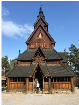
Photos at Folk Museum

I also travelled to Prague in April. It is a beautiful city with many remarkable red houses. Český Krumlov is considered one of the most beautiful town and I highly recommend to visit this town, which just takes you about two to three hours to go from Prague by bus. Prague’s price level is much lower than Oslo and you can also enjoy lots of food with acceptable price.