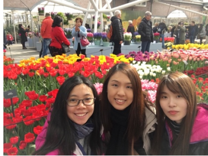
Tulips in Keukenhof