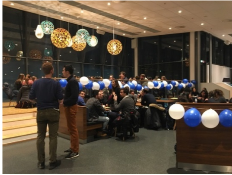
BInner at BI