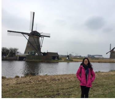
Windmills in Kinderdijk