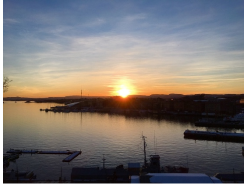
Sunset at Akershus Fortress

There is a long Easter holiday in March (Norway has the world's longest Easter holiday!). So I could go for a long trip during Easter. I went to Brussel, Paris, Frankfurt, Rotterdam and Amsterdam. Brussel is a place which is full of chocolate. If you are a chocolate lover, you definitely have to go there and try the chocolate in every shop! Paris is a romantic city with its iconic magnificent Eiffel Tower. However, it is reminded to be aware of your personal belongings. There are pickpockets and conman especially in a crowd. For Frankfurt, I think is a modern city without many attractions to visit. Rotterdam is a special city with buildings of extraordinary shapes. It is also famous of windmills in Kinderdijk. Finally, I visited Amsterdam for the flower exhibition in Keukenhof to see countless tulips of various kinds in full bloom. Bundle ticket with both exhibition and transportation are available online. This Easter holiday is really fantastic.